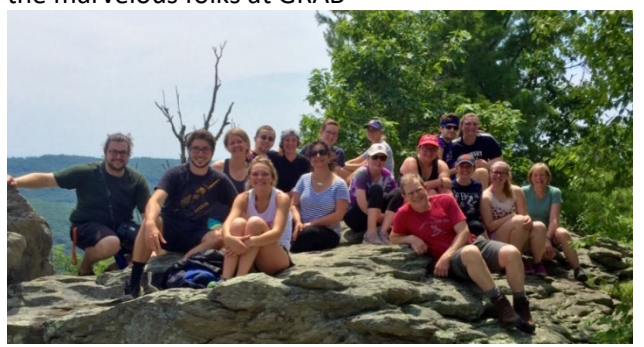
X-SIG faculty hosted a hike for summer research students up to Chimney Rocks in Michaux State Forest